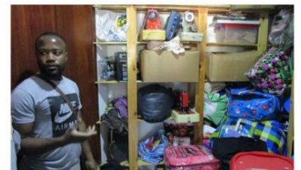
Local CEI coordinator in Agadir, Morocco

Order Additional OGHS Materials at www.uccresources.com