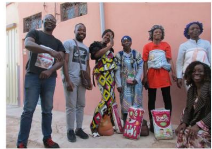
Migrant beneficiaries with the CEI team, near Agadir, Morocco