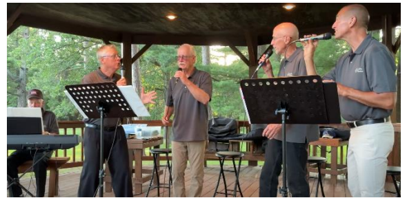
The Golden Harbor Quartet – July 17, 2024