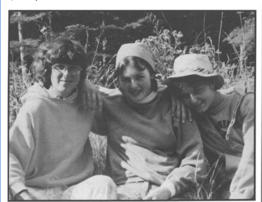
Rev's Cabin August 1977