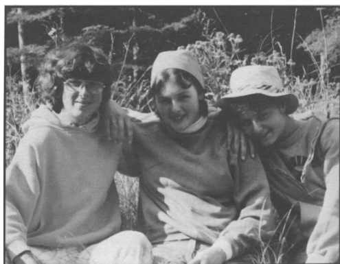
Rev's Cabin August 1977